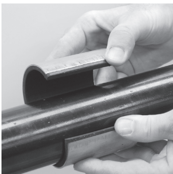
Position the Mini-BAND insert as shown.

The Mini-BAND Clamp is available with zinc-plated steel or stainless steel bolts and nuts.