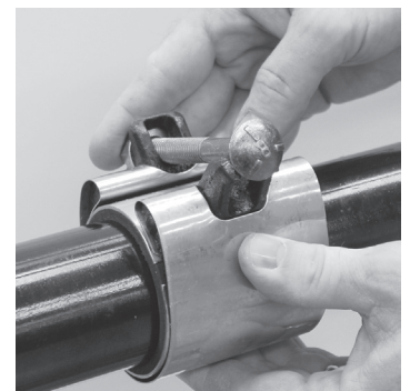
Drop in the bolt and tighten.