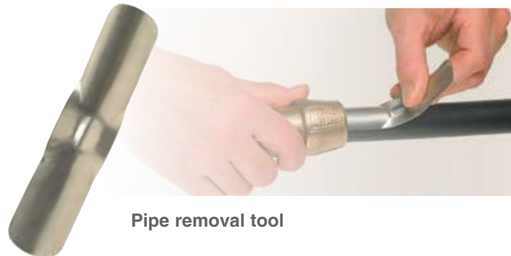
Pipe removal tool