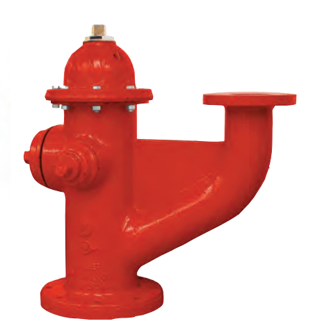
MONITOR STYLE SUPER CENTURION FIRE HYDRANT (A-479)