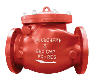
350 PSI SWING CHECK VALVE (A2122B1)