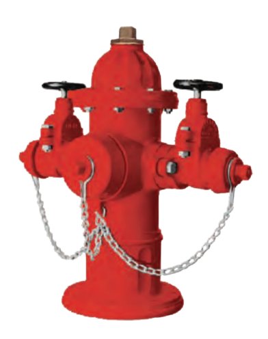
SUPER CENTURION WITH INDEPENDENT HOSE GATE VALVES (A-423-370)