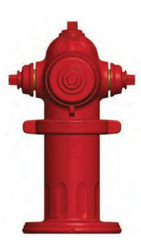
SUPER CENTURION FIRE HYDRANT (A-403)