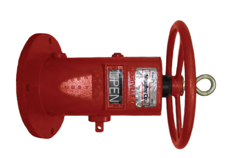
WALL-TYPE INDICATOR POST (A-20814 4" - 14")

Mueller indicator posts are used in fire protection systems and perform several functions. The indicator post provides a means to operate a buried or otherwise inaccessible valve. Also, the indicator post readily and clearly indicates whether the valve is open or shut.