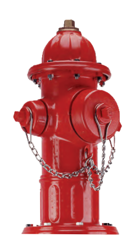
SUPER CENTURION FIRE HYDRANT (A-423)

Mueller fire hydrants are known throughout the fire protection industry for superior flow characteristics, dependability, ease of repair, and aftermarket support. Super Centurion® hydrants are manufactured in a Mueller ISO 9001 Registered facility in Albertville, Alabama, USA and are backed by a 10-year limited warranty on materials and workmanship.